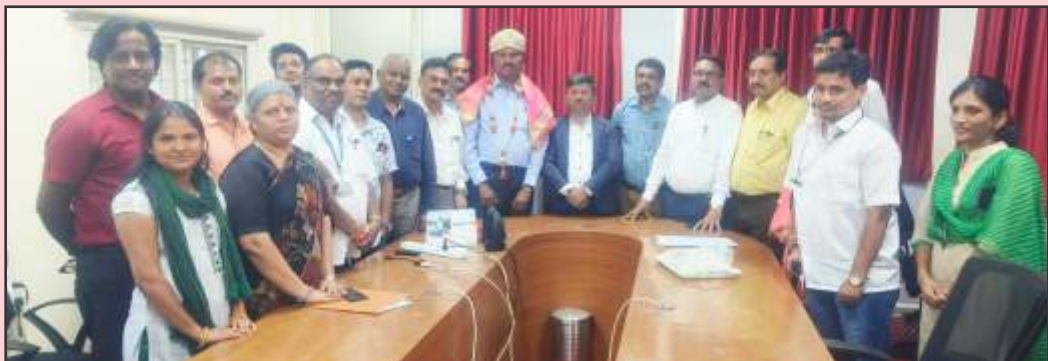
Bangalore Urban District DHO office felicitation for IMA KSB President as a gesture during DAC PCPNDT meeting on 4th November 2023.