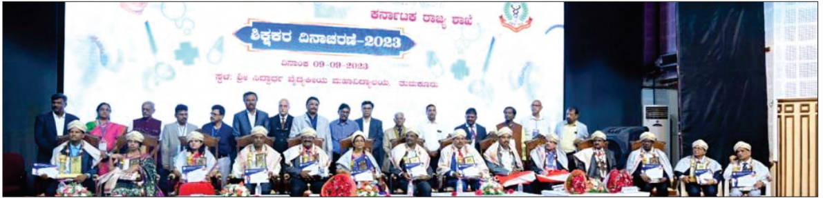
IMA KSB Teachers Day Awardees